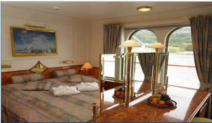
Suite on upper deck with panorama windows