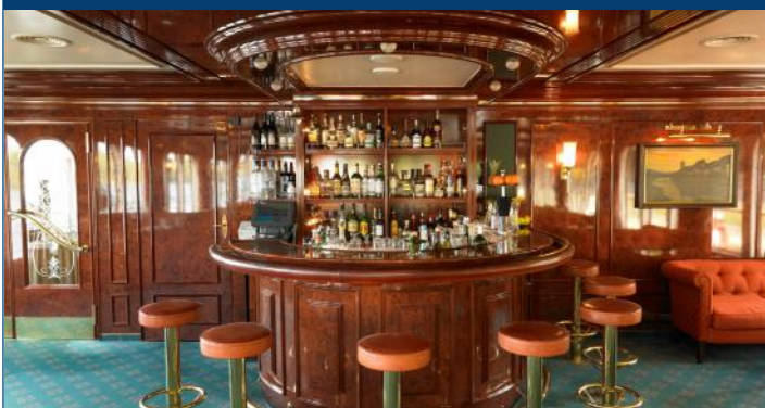
Lounge with Bar