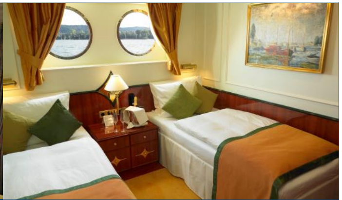
Cabin on main deck with portholes