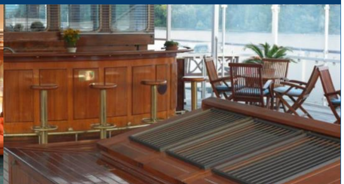
Sun Deck with Bar

MV ROYAL CROWN is a maritime vessel with finest brass and wooden interior - the „First Lady of Europe’s most beautiful rivers, a luxury private cruise ship that weaves itself into the lives of every generation and appeals to all ages by bringing them together for joyful, authentic and unforgettable encounters“.