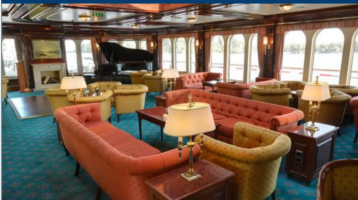
Lounge with Piano